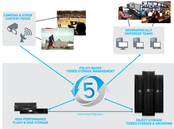
Figure 3: For broadcasters, object storage provides economical storage of large-scale, long-term, distributed content repositories.

Because it offers disk-speed access, Lattus can extend broadcast facilities' online storage to significantly reduce their highest-performance storage requirements. In some cases, media workflows have been set up to successfully migrate content after 10 days since last access, with the assurance that migrated content can be quickly accessed from the Lattus extended online storage.