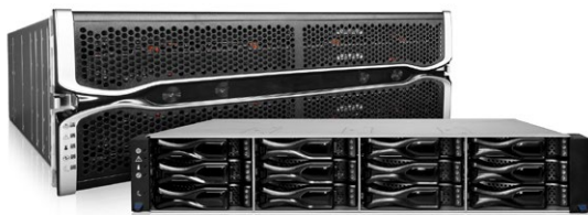
StorNext Q-Series ▲