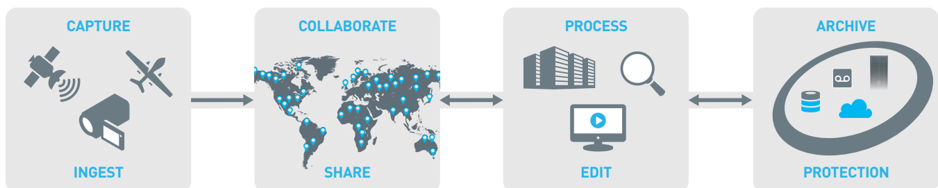
Fig. 2: Large, data-intensive workloads served by Quantum's StorNext Scale-out Storage.

StorNext enables high-performance capture, collaboration, archive, and protection of valuable data. Reliable, secure, and proven storage from experts you can trust.